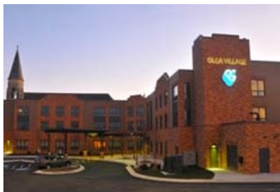
Olga Village, Milwaukee